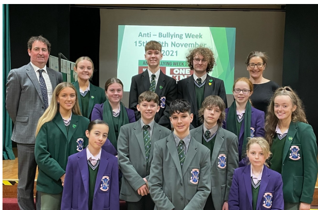
Anti-Bullying Week at St. Louis

St. Louis Grammar School provides its students with a magnificent platform to go forward and embark on a diverse range of careers. University, college and employment destinations of the recent 'Class of 2021' reflects the unique interests, abilities, talents and aspirations of each individual St. Louis student. 91.7 % of 73 UCAS applicants gained a place on a Higher Education Honours Degree Course in August 2021 with two of those students electing to accept offers of a Higher-Level Apprenticeship. 89% of St. Louis UCAS applicants were accepted onto their first-choice degree course.