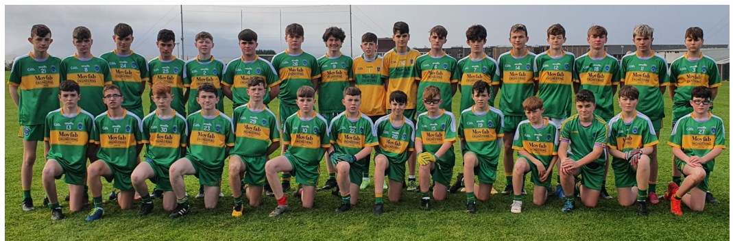
Year 10 Boys 2021/22

The Year 10 Boys commenced their program with a hard earned draw v Aquinas College, Belfast. They now face an Ulster Quarter-final after defeating St. Malachy's Belfast in the group stages. Year 10s now play Keady in the QF.