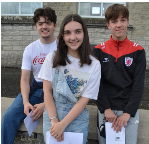
AS Success at St. Louis