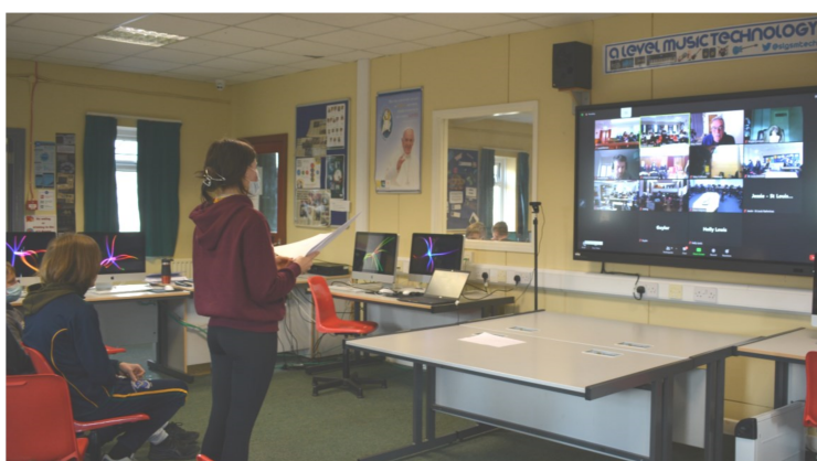
St. Louis Network Masterclasses

St. Louis English and Art department have been running an internal competition to mark Anti-bullying week. Students had to create posters and poems on the theme of "One Kind Word". Pictured above are the winners with the Senior Leadership Team who gave a presentation focused particularly on the responsible use of social media.